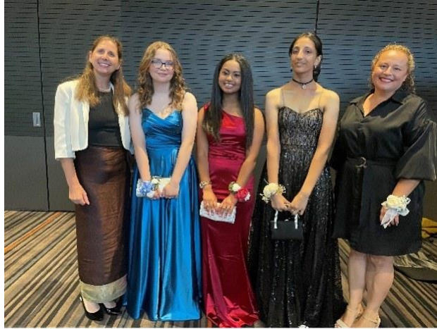
12 - Auslan students