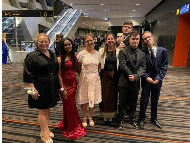
10 - 2024 Year 12 DHH students