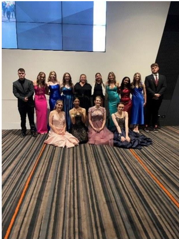
13 - Auslan students