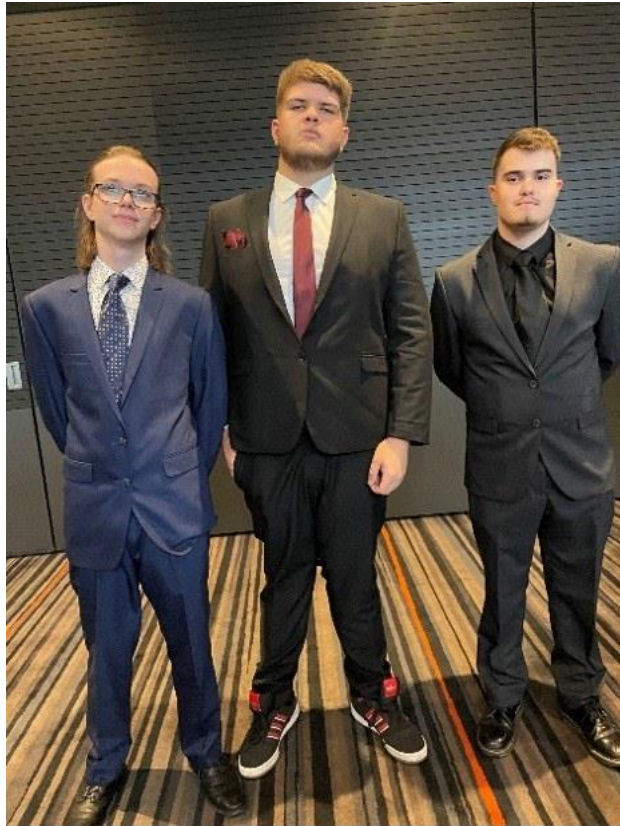
11 - 2024 Year 12 DHH students